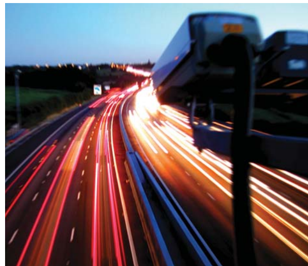
Harness the power of your number plate data with i2's dedicated analytic environment